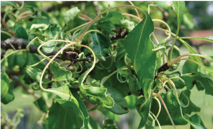
Figure 3. Organo-auxin herbicide drift symptoms on sensitive plants.