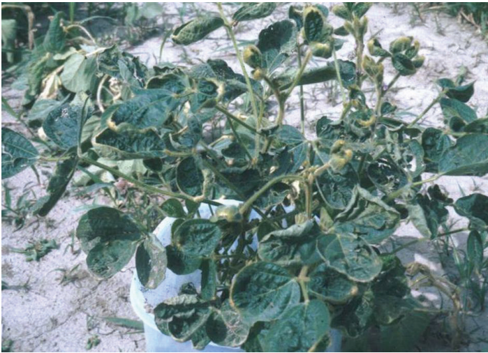
Figure 1. Organo-auxin herbicide drift symptoms on sensitive plants.