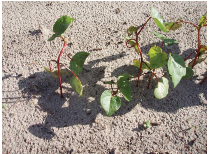
Figure 4. Organo-auxin herbicide drift symptoms on sensitive plants.