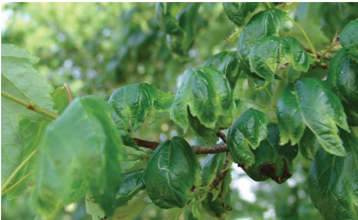
Figure 2. Organo-auxin herbicide drift symptoms on sensitive plants.